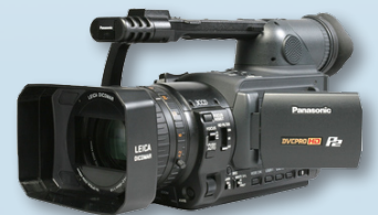
Panasonic HVX-200A ($3,200)