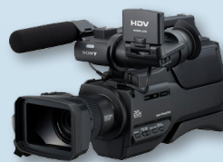
Sony HVR-HD ($1,549.95)