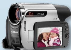
Canon ZR960 ($249.99)

Here are a few cameras that we have used and like