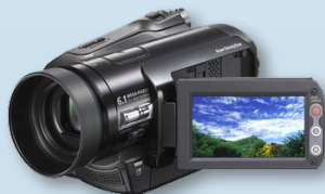
Sony HDR-HC9 ($1,099)